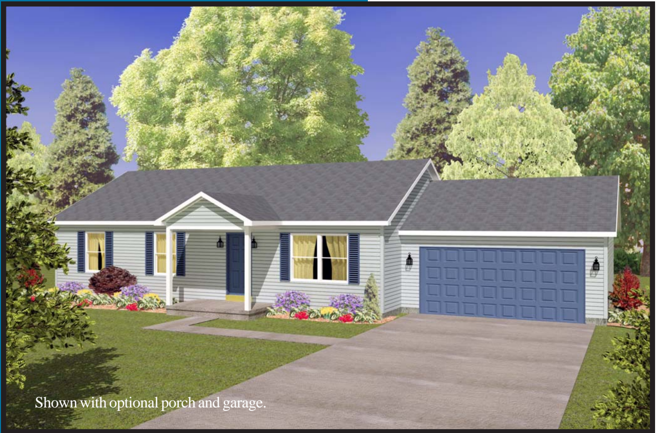
Shown with optional porch and garage.